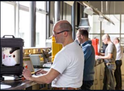
TEMPERATURE CALIBRATION -200/600°C (-328/1100°F)